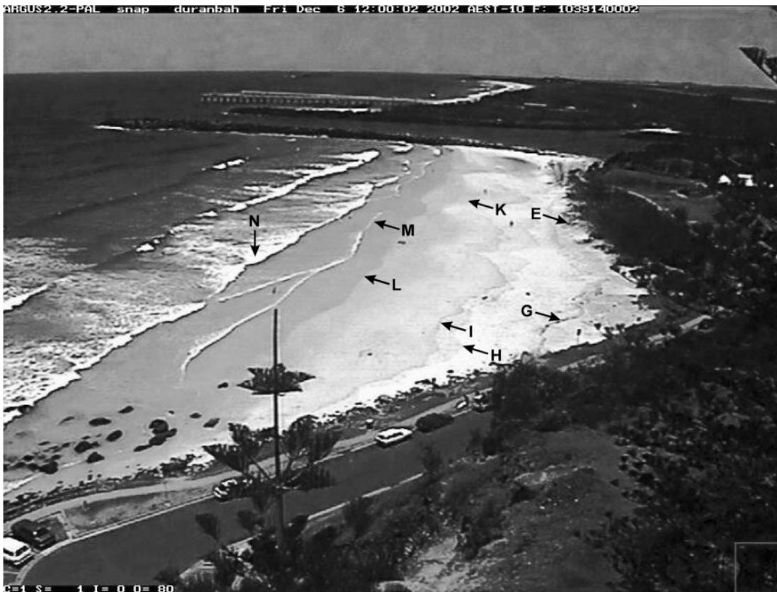
Figure 2. An example of a range of visibly discernible shoreline indicator features, Duranbah Beach, New South Wales, Australia. For key, see Figure 1.